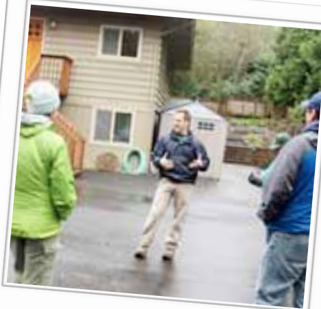
Mentors trained at a native plant ID workshop.

ABOUT Since 2008, trained volunteer "Mentors" from the community assist and advise landowners on completing stream-side restoration projects, native gardening, and stormwater management.