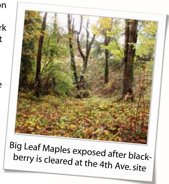
Big Leaf Maples exposed after blackberry is cleared at the 4th Ave. site

ABOUT Over 1 acre of dense blackberries and 3 acres of ivy will be removed and replanted with native trees and shrubs on this joint partnership between two private property owners and Tryon Creek State Park just west of the SW 4th Avenue entrance to the State Park.