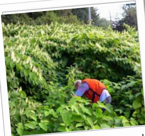
Japanese Knotweed is surveyed at a TCWC treatment site.

ABOUT TCWC works with partners on an Early Detection/ Rapid Response program for Knotweed in the watershed. Knotweed patches are located, mapped, and treated, and in riparian areas, replanted with native species to help ensure this aggressive plant does not decimate our watershed.